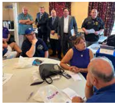
JUNE GENERAL MEMBERSHIP MEETING - ELMSFORD, NY