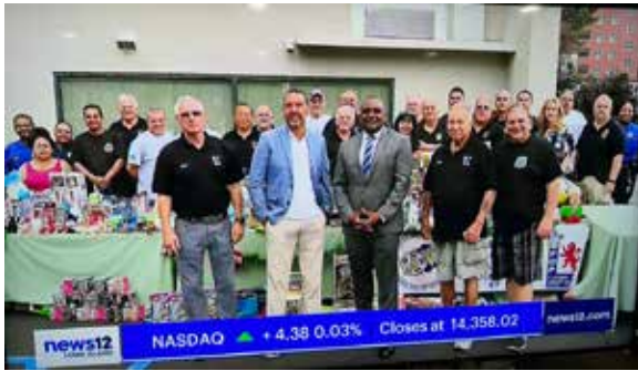
CHRISTMAS IN JULY